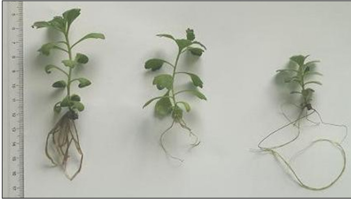
Fig. 2. Microcuttings of ajania of 'Bea', 'Bess' and 'Silver and Gold' cultivars (from the left) produced from single-node explants after eight weeks of culture

Rys. 2. Mikrosadzonki ajanii odmian 'Bea', 'Bess' oraz 'Silver and Gold' (od lewej) uzyskane z jednowęzłowych fragmentów pędu po ośmiu tygodniach kultury